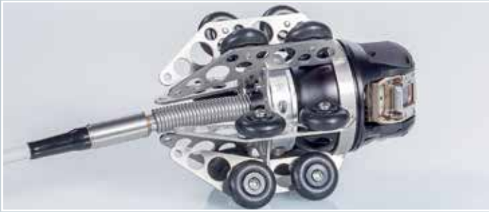
Camera centering for KS 60 DB