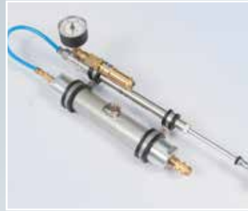
Pressure filling system