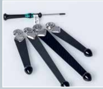
PIN Set for KS 60 DB to control the camera in branched laterals