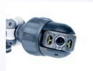
KS 60 CL