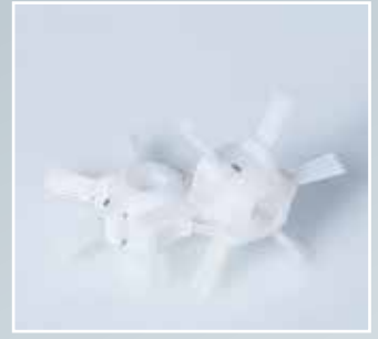
Camera centering for SAT 42