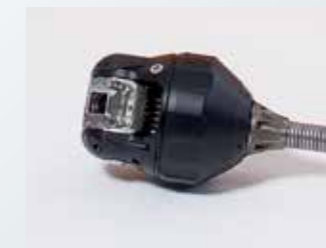
KS 60 DB

For diameters starting from 50 mm, the DELTAs can be either combined with the cameras SAT 40, SAT 42, KS 60 CL or starting from 100 mm with our top-of-the-line model, the fully digital pan and tilt camera KS 60 DB.